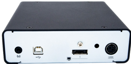
ADDERLink INFINITY 1102 TX - Rear