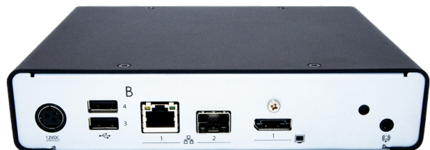
ADDERLink INFINITY 1102 RX - Rear