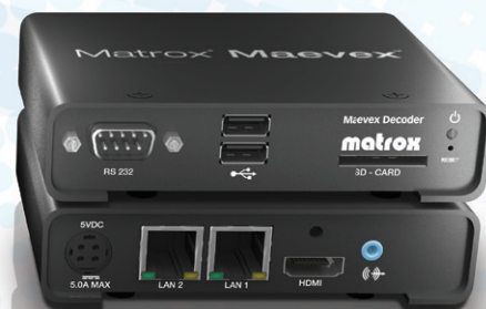
Matrox Maevox 5150 Decoder unit front/back