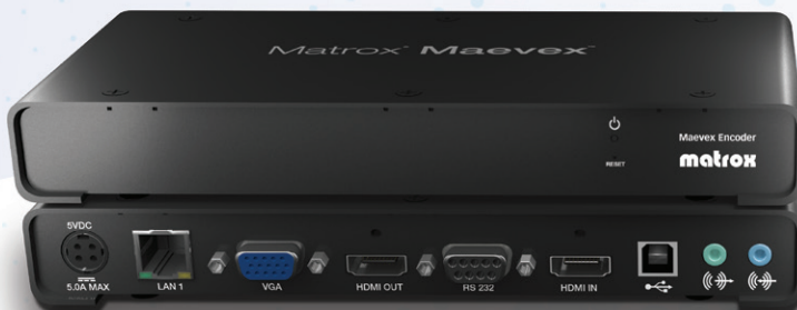
Matrox Maevox 5150 Encoder unit front/back

Within these environments, Maevox takes full advantage of existing and standardized COTS IT networking equipment and networks, employing them to send data, as well as high-quality, Full HD video at very low bandwidth. Maevox consequently possesses tremendous value due to its low price point, but also its overall cost-effectiveness, leveraging standardized COTS networking equipment and providing excellent quality at low bandwidth.