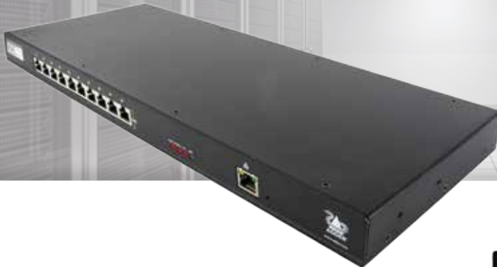
19 inch rack mountable switch, DVI, USB and audio