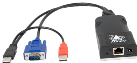
ADDERLink INFINITY 100T - VGA