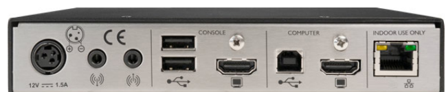
ADDERLink XDIP - Rear