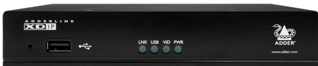
ADDERLink XDIP - Front