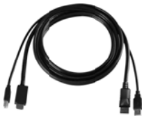
CK-6P DP KVM cable, 6 ft 4K 60Hz