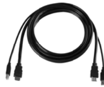
CK-6H HDMI KVM cable, 6 ft 4K 60Hz