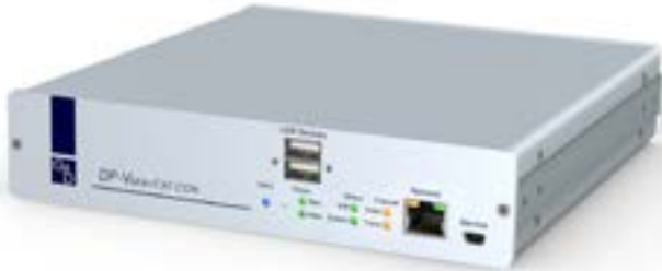
DP-Vision-CAT-ARU user module