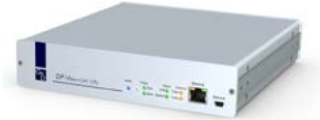
DP-Vision-CAT-ARU computer module