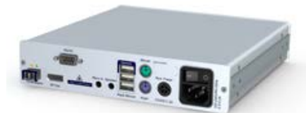
DP-Vision-Fiber-AR user module