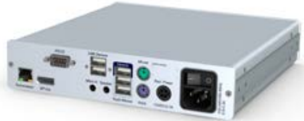
DP-Vision-CAT-ARU user module