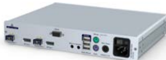
DP-Vision-Fiber-MC2-AR user module