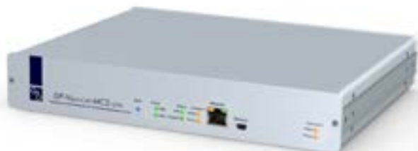
DP-Vision-CAT-MC2-ARU computer module