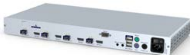
DP-Vision-Fiber-MC4-AR user module