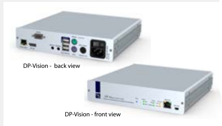
DP-Vision - back view

With its network port, the web interface and monitoring functions, the DP-Vision system offers important features for mission-critical applications.