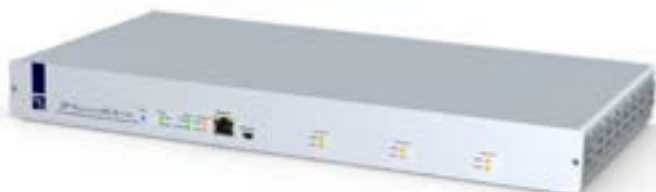
DP-Vision-Fiber-MC4-AR user module