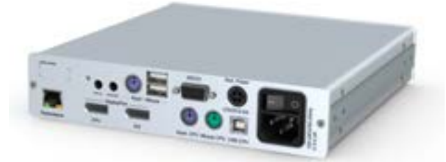
DP-Vision-CAT-ARU computer module