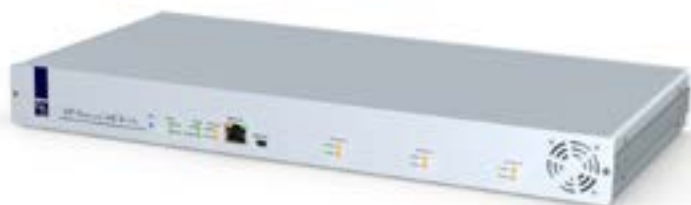
DP-Vision-CAT-MC4-AR computer module