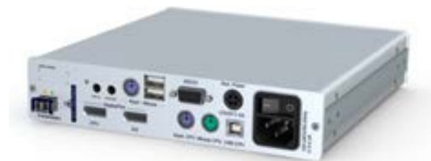
DP-Vision-Fiber-AR computer module