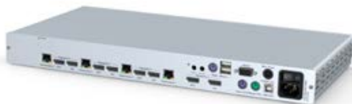
DP-Vision-CAT-MC4-AR computer module