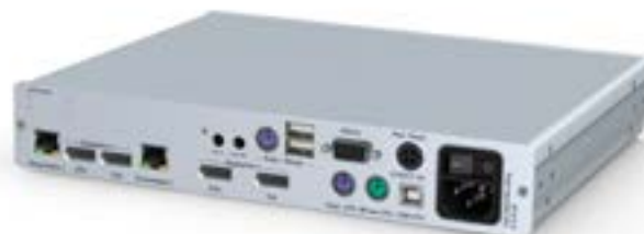
DP-Vision-CAT-MC2-ARU computer module