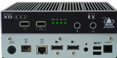
ADDERLink XD642 RX - Front & Rear

CAT6 is recommended for CATx extensions. CATx extensions are limited to 2 short patch connections. Patch cables should be CAT6 or better.