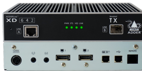
ADDERLink XD642 TX - Front & Rear