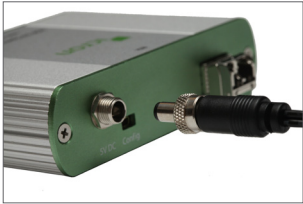
Locking Power Connector

*Achievable USB 3.0 Extension by Multimode Fiber Class