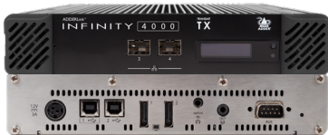
ALIF4001 TX - Front & Rear