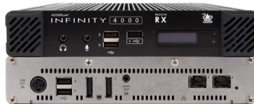
ALIF4001 RX - Front & Rear