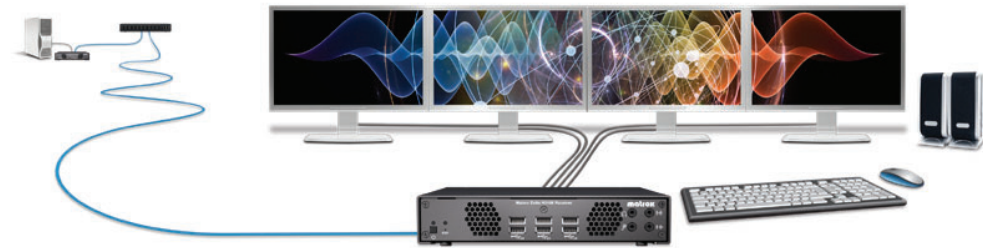
Extio 3 extends up to four displays over standard Gigabit network infrastructure