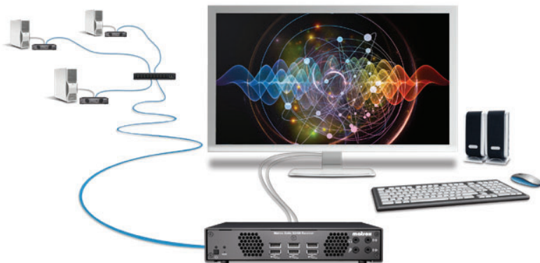
Extio 3 supports one-to-one, many-to-one or many-to-many configurations

1. Supports RJ45 copper transceiver, SFP multi-mode or single-mode transceiver (sold separately). 2. Upgradeable to fiber multi-mode or single-mode SFP transceiver (sold separately).